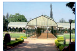
Lalbagh Botanical Garden